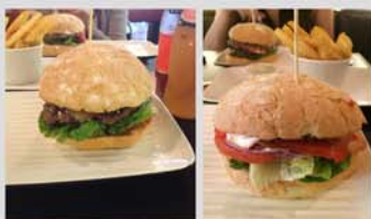
Left to right: Crispy Bacon and Cheese Beef Burger $11.50, Moroccan Lamb Burger $12.90, and Hand cut chips $3.50

We're given cute menus on mini clipboards and find an extensive range of burgers: beef, lamb, chicken and vegetarian, served in either sourdough or wholemeal bread. Also on the menu are salads and hand cut chips accompanied by homemade sauces.