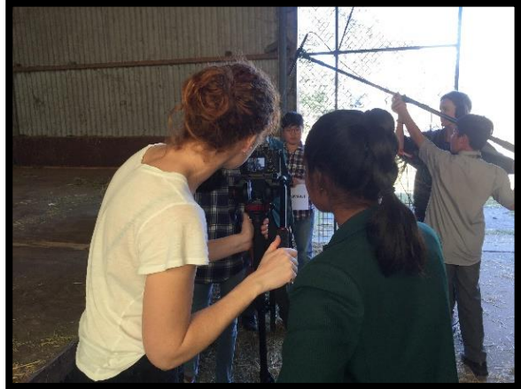
Some images captured during the filming of our short film.